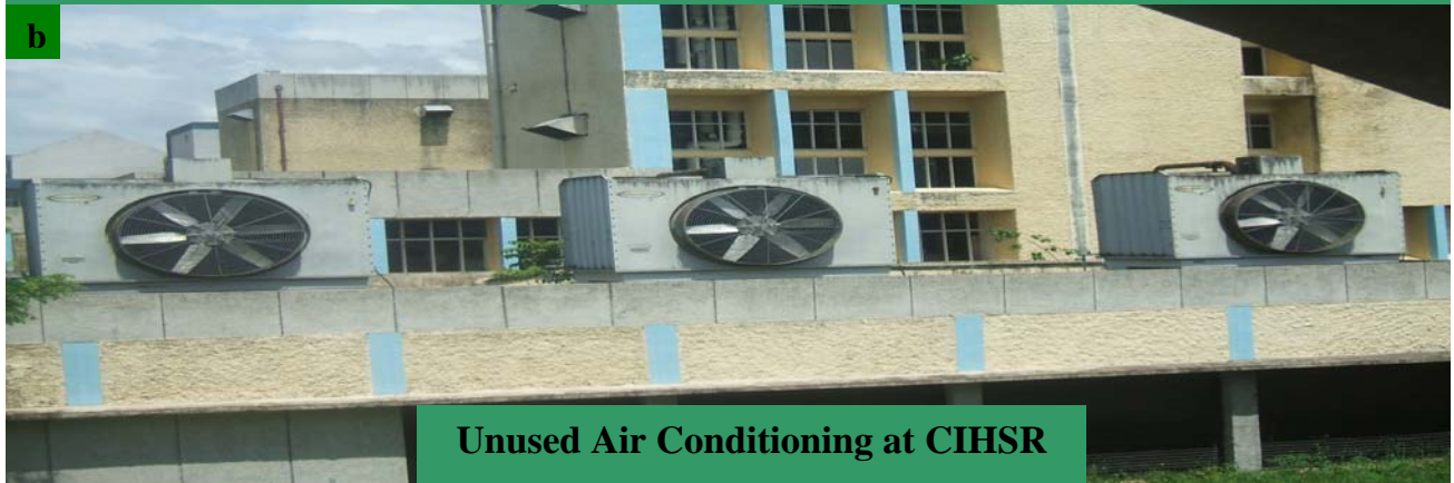
Unused Air Conditioning at CIHSR