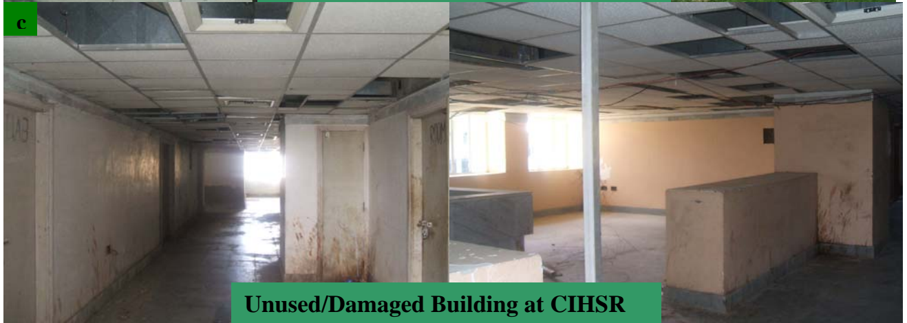
Unused/Damaged Building at CIHSR