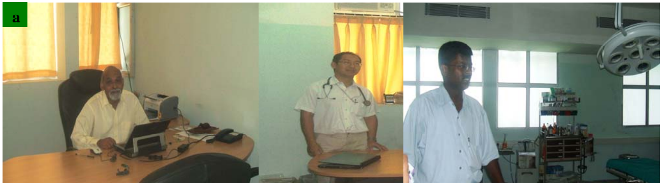
(L to R)- Director CIHSR, Medical Superintendent CIHSR, Administrator CIHSR.