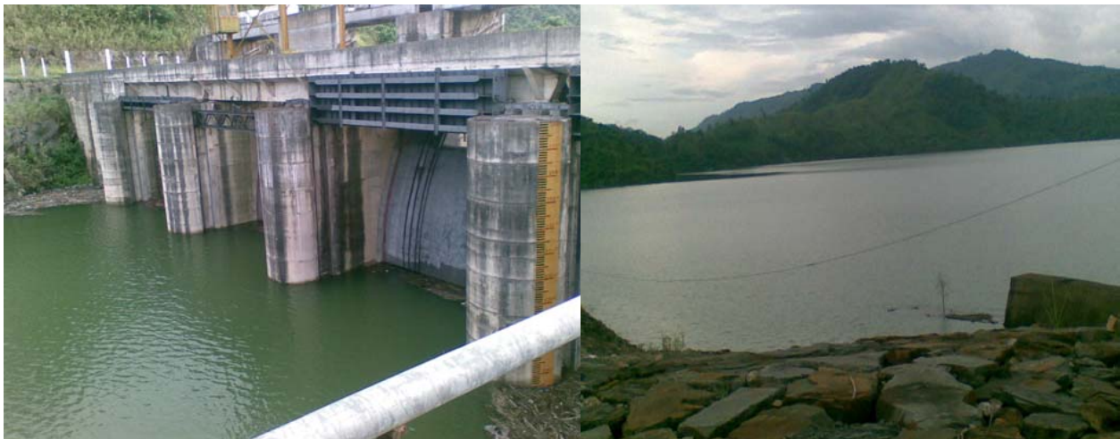
A view of the Doyang Hydro Electric Project in Wokha District