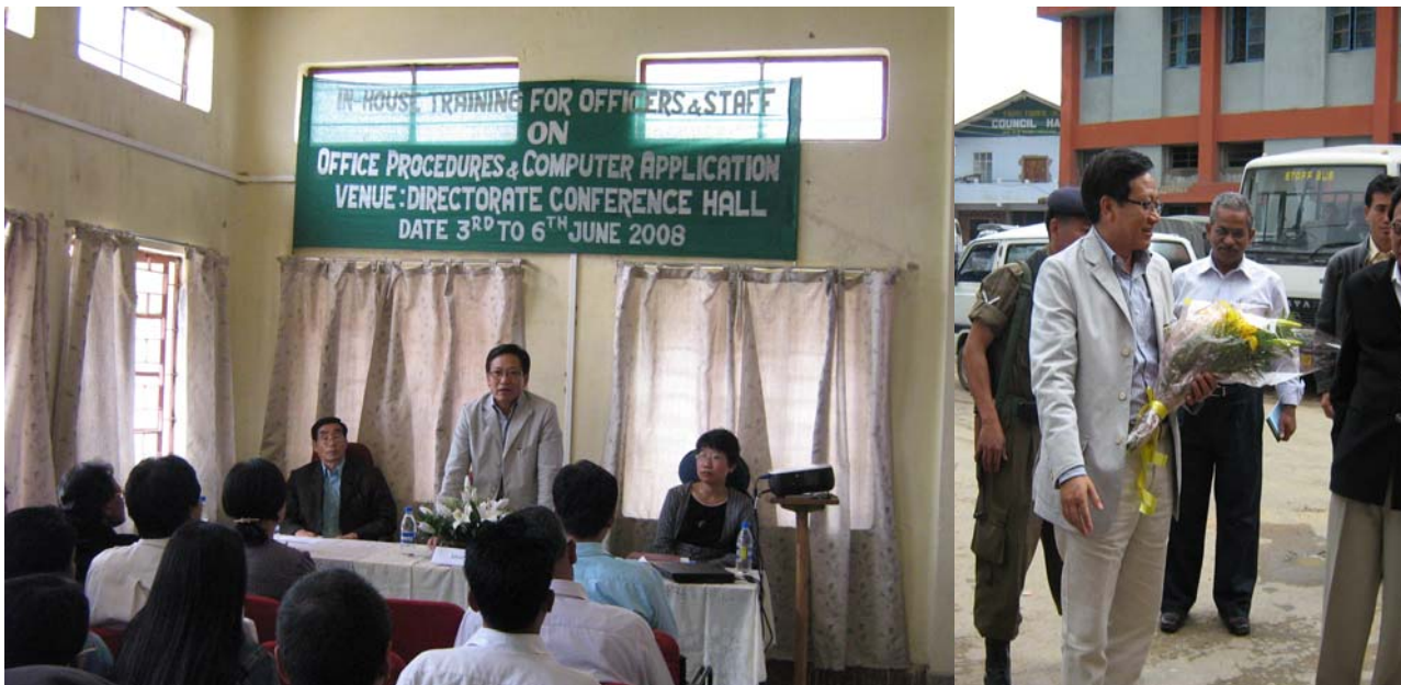
Shri.T.R.Zeliang Hon'ble Minister Planning & Coordination & Evaluation during the launching of the Website.

A website of the Evaluation Directorate nagaeval.nic.in was uploaded and launched by Hon'ble Minister for Planning & Coordination, Evaluation, Veterinary & Animal Husbandry & Parliamentary Affairs, Shri.T.R.Zeliang on 2 nd June 2008 in the office premises. The site contains the published evaluation reports and can be down loaded. The Civil List of the Department, service profile of the employees with activities and work plans of the Department is available on the site.