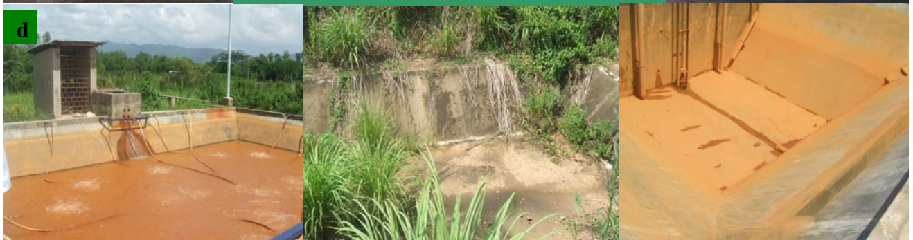
Water Treatment Plant at CIHSR