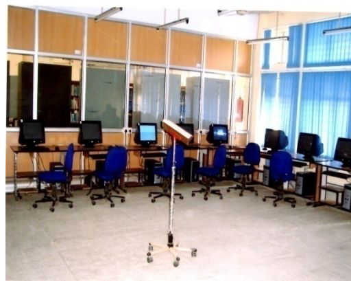
Internet locations in Central Library

Scrutiny revealed that out of 32 departments, one library, three hostels, Examination Centres and Administration, only 14 locations in eight 12 academic departments had been brought under networking connection whereas the remaining departments were still under the process of networking. Thus, the delay in network connectivity mainly in academic departments in spite of availability of fund, deprived the students and faculty members from the intended benefits.