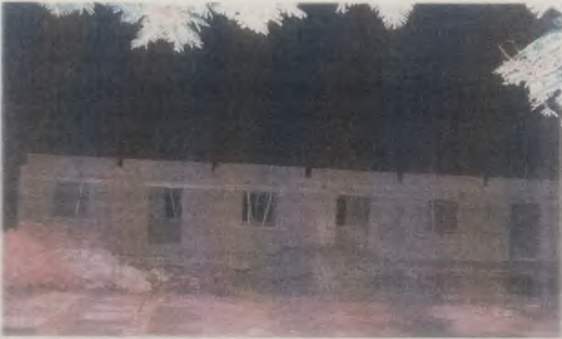
Class room building at roof level