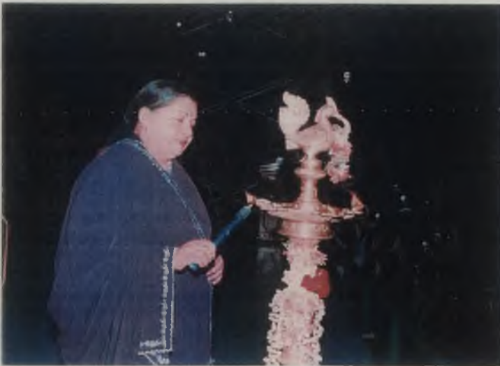
Hon'ble Chief Minister of Tamilnadu launches the Programme by lighting the traditional lamp. (Kuthu Vilakku)