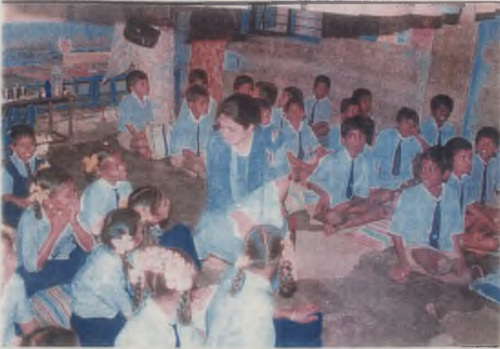
Children wearing free uniforms supplied by Government of Tamilnadu