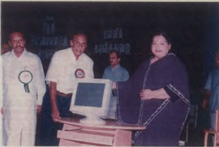
Hon'ble Chief Minister of Tamilnadu distributes Computer to DPO