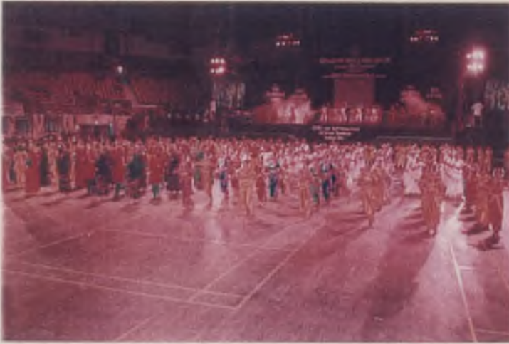
Cultural Programme highlighting SSA Themes