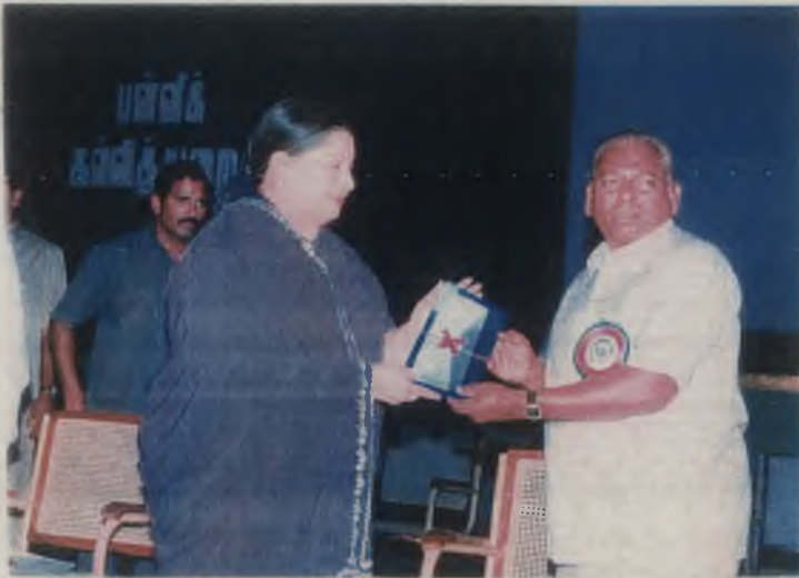
Hon'ble Chief Minister of Tamilnadu handing over School Grant to a Headmaster