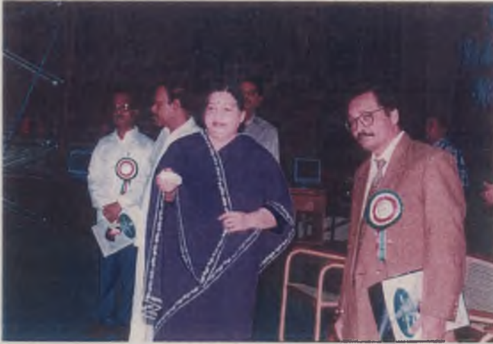
Hon'ble Chief Minister of Tamilnadu unveils the foundation stones of new school buildings. Hon'ble Education Minister, Education Secretary and State Project Director look on.