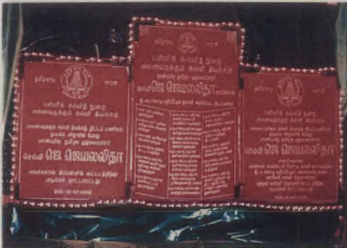
The stones with names of the developmental schemes of SSA inaugurated by the Hon'ble Chief Minister of Tamilnadu