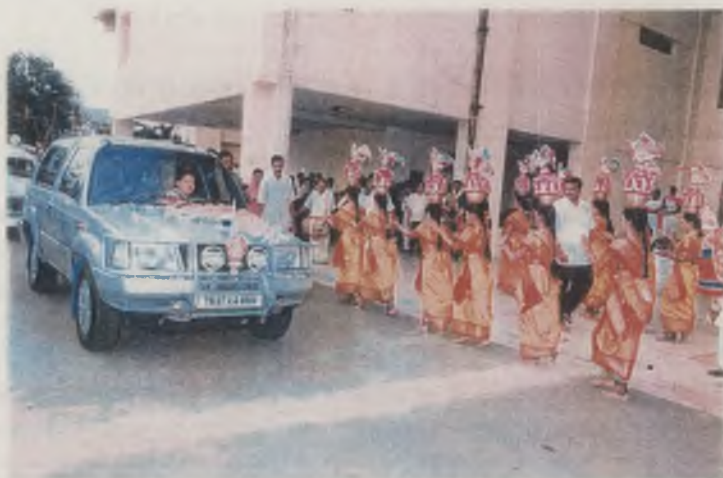
Awareness of EFA programme through Folk dance