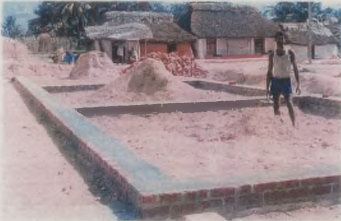
Class room building at Basement level