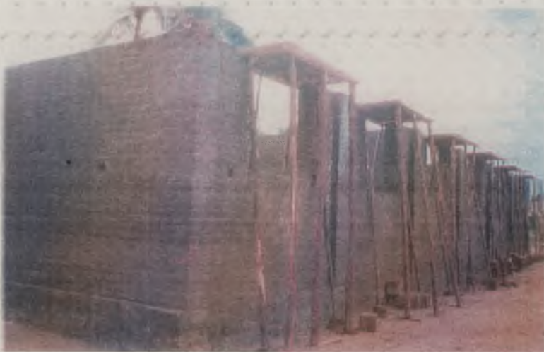
Class room building at Lintel Level