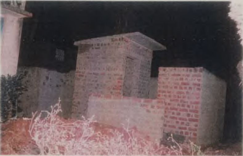
Construction of Toilet Block