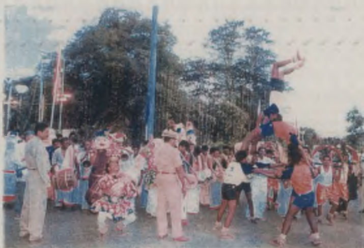
Awareness of EFA programme through Folk event