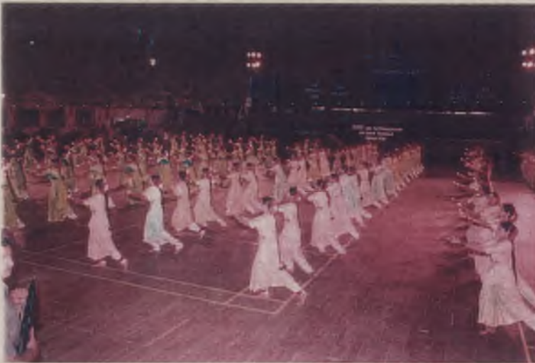
Cultural Programme highlighting SSA Themes