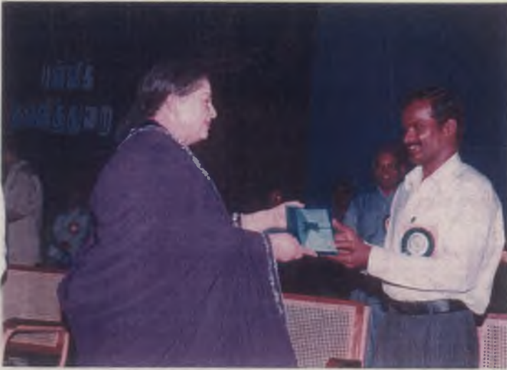
Hon'ble Chief Minister of Tamilnadu handing over appointment order to a BRC Teacher Educator.