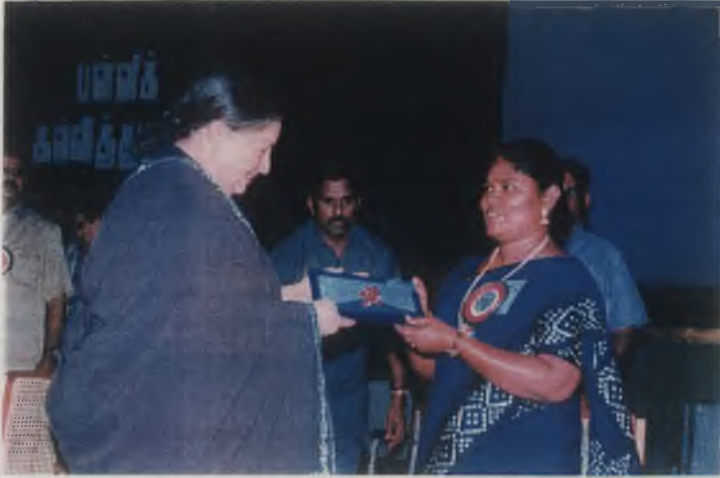
Hon'ble Chief Minister of Tamilnadu handing over TLM Grant to a Teacher