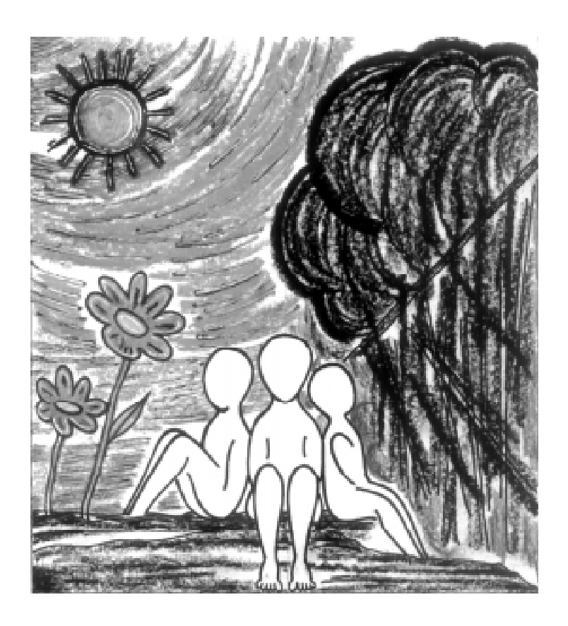
A Report on the