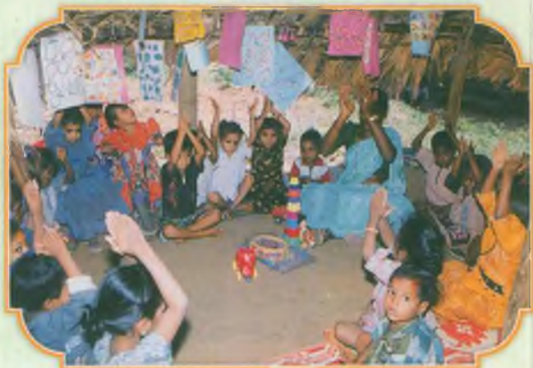
Early Child Education Centre, Padalapeta Vizianagaram Dist.

"That service is the noblest which is rendered for its own sake"