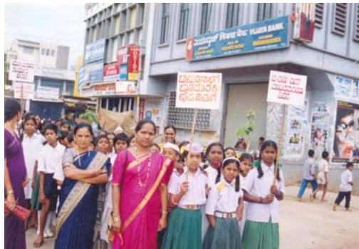
Special Enrolment Drive at Shimoga