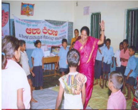
ASHA KIRANA AT BHADRAVATHI BLOCK

2. Ashakirana Centers: Are residential in nature. It is one of the main and important programme provided for the children to avoid from dropping out due to various reasons like poverty and poor economic condition. Hostel facility has been provided to the school going children at school/ community hall/Public buildings and school etc., Educational volunteers and an assistant is appointed by the NGOs. It is mostly run by NGOs with the cooperation of Head master and SDMC. 19644 children have been covered in 640 centers.