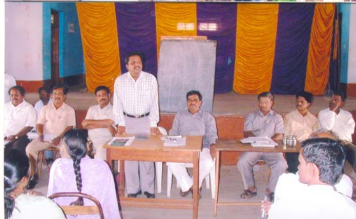
Habitation Level Planning (Bijapur)