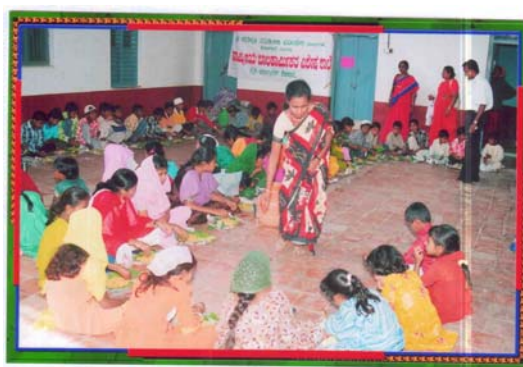
NCLP School at Millath nagara, Kolar Tq.

centers. These schools are run by the NGOs and they are supervised by the Deputy Commissioner of the district. It runs for the duration of 12 months.