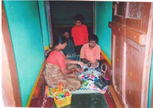
Home Based Education in Malur Tq., Kolar dist.,