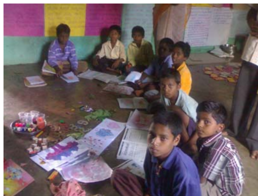
Chinnara Angala center at Arkere, Tumkur taluk

Chinnara Angala (2 months RBC and NRBC) conducted in the summer vacation, which prepares the child to join the mainstream. 6308 children are covered in non residential and 4319 children are covered under Residential Chinnara Angala. Totally 10627 children have been mainstreamed.