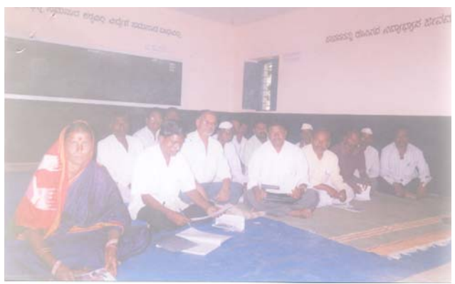
Habitation Level Planning (Bijapur Taluka) Block Level Planning Meeting (At Bijapur)