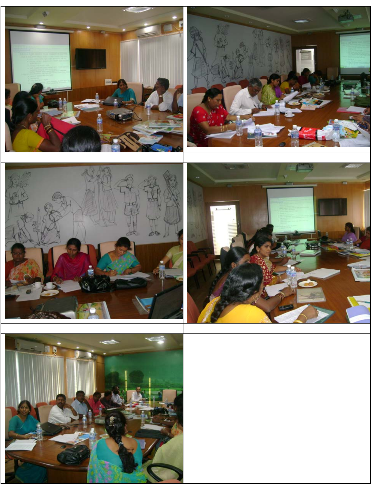
Community / Non-profit making bodies.

Community is a part of the administrative organogram at the school level. It contributes in terms of identifying girls and also in the form of identifying the Donors who help in not only giving donations, but also in material contributions to the Development of KGBVs of their locations.