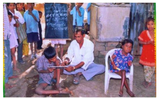
Home Based Education in Shahapur Block

✓ Special enrolment drive: This programme was to pursue the parents of the children not enrolled, to enroll their children to schools. The parents are made aware of the importance of education. 12906 children were brought to school through this programme.