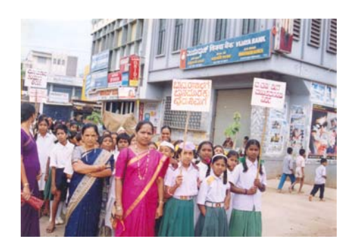
Special Enrolment Drive at Shimoga

✓ Special enrolment drive: This programme was to pursue the parents of the children not enrolled, to enroll their children to schools. The parents are made aware of the importance of education. 12906 children were brought to school through this programme.