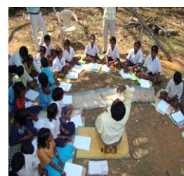
Story Telling Festival