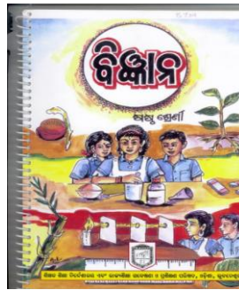
Class VI Science Book