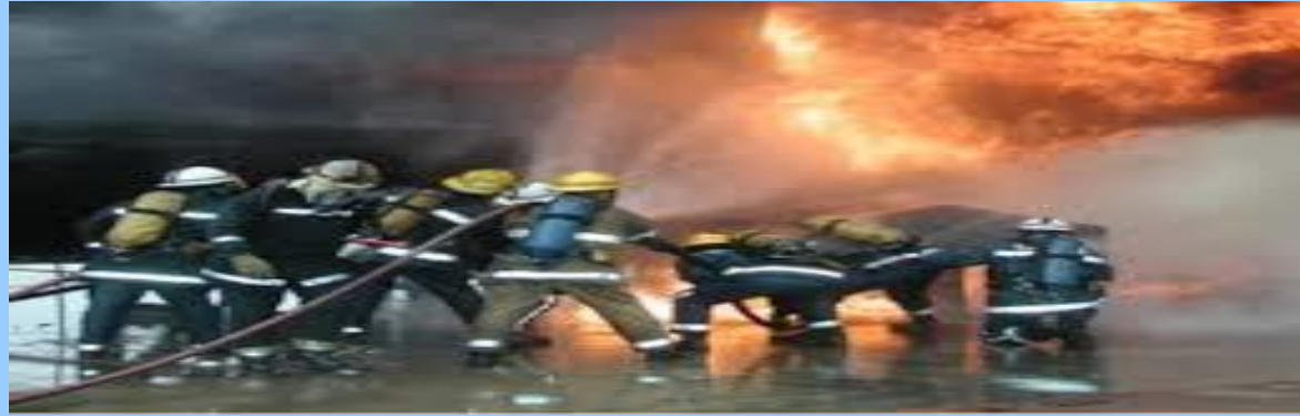
Table No 26.5 Fires Attendance and Property Damaged/salvaged for 2012-13