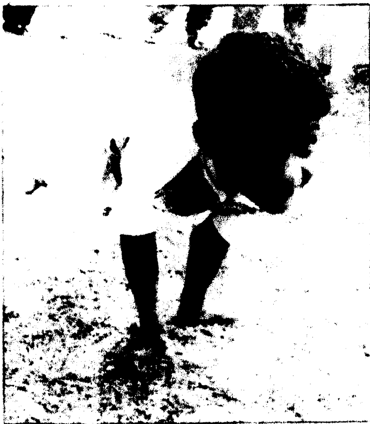
इस पंख नहीं तो क्या, इतिहास में काफी नहीं विकलांगों के लिए आयोजित प्रतियोगिता में प्रतिभा प्रदर्शित करना जानकर।

विकलांग विद्यार्थियों ने दिखाए खेलों में जौहर