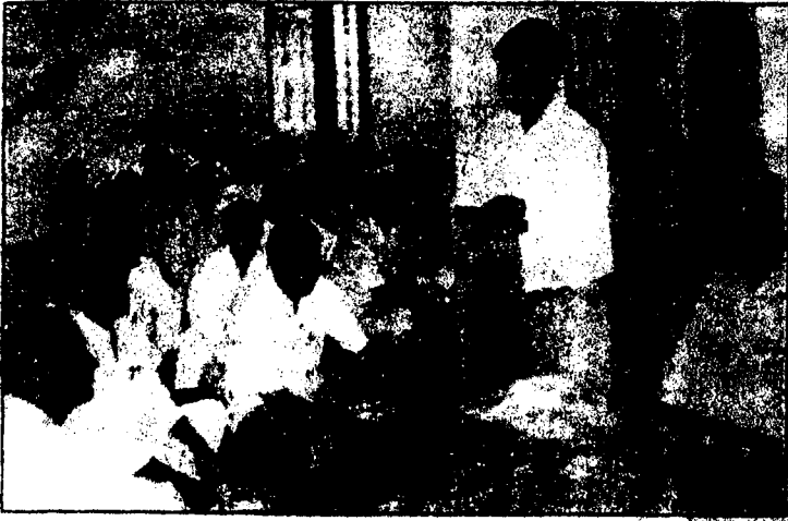
■ उकलाना में प्रशिक्षण प्राप्त करते अध्यापक।

उकलाना : राजकीय त्रिख माध्यमिक विद्यालय उकलाना परिसर में ग्रोथकालीन अवकाश के दौरान आयोजित शिविर में सर्व शिक्षा अभियान के