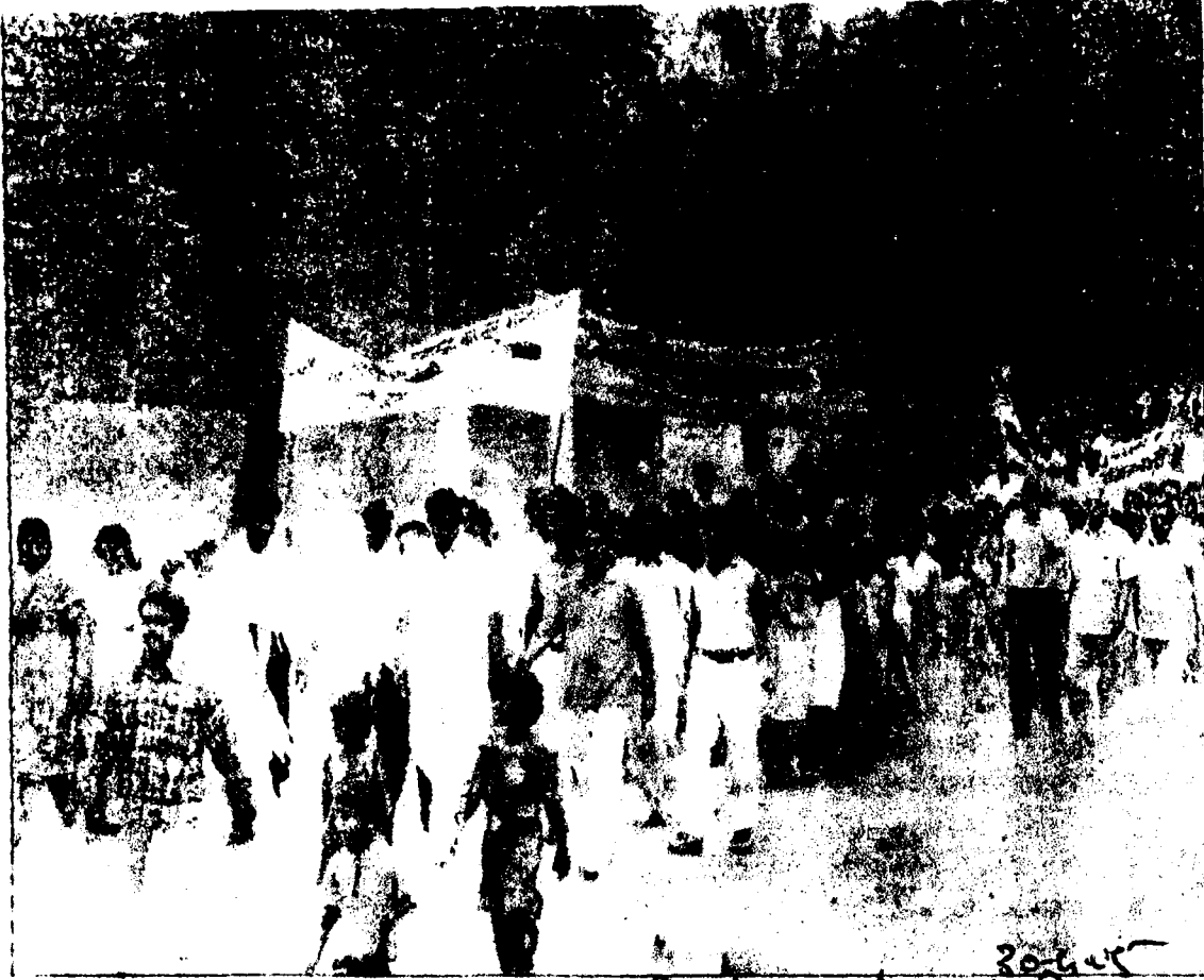
उकलाना। ग्रामीण क्षेत्रों में निकाली शिक्षा जागरूकता रैली।