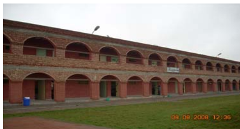
Cumulative Progress of Civil Works under SSA