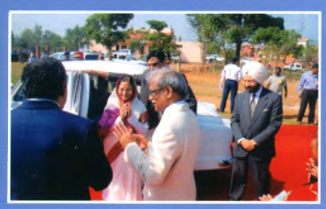
Smt. Pratibha Devisingh Patil, Hon'ble President of India, arrives at the Convocation venue.