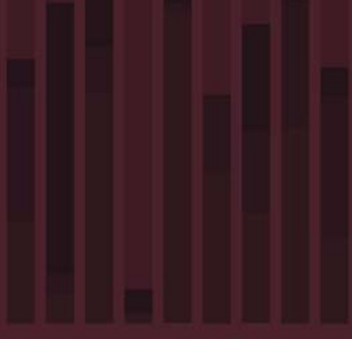
Ministry of Minority Affairs Paryavaran Bhavan, CGO Complex, Lodhi Road New Delhi 110 003