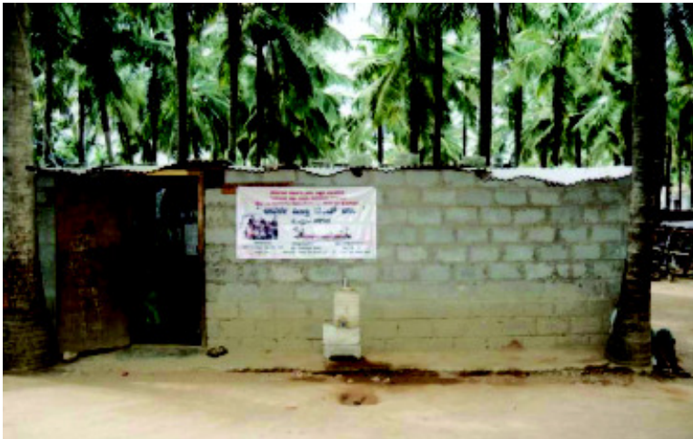
A tent school at a building construction site in Bangalore City. The enlightened residents of the area have convinced the builder to construct this school. But in most of the cases, the Karnataka SSA authorities are yet to persuade the employers to provide space for educating children.