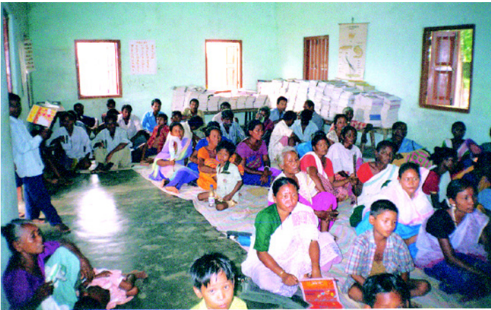
Meeting with the parents of RBC learners.

Setting up an RBC and managing it requires both high human and monetary resources. Therefore, facility of RBC is not provided to all out-of-school children. Only most 'difficult to reach' children are catered through RBCs. RBCs are run for child labourers rescued from employers, wage earning or non wage earning working children who stay with their families but bear the risk of dropping out even after enrollment in NRBCs or mainstreaming in formal schools. . In Assam, highest preference is given for child labours of 10-14 years of age and children living with extreme poverty.