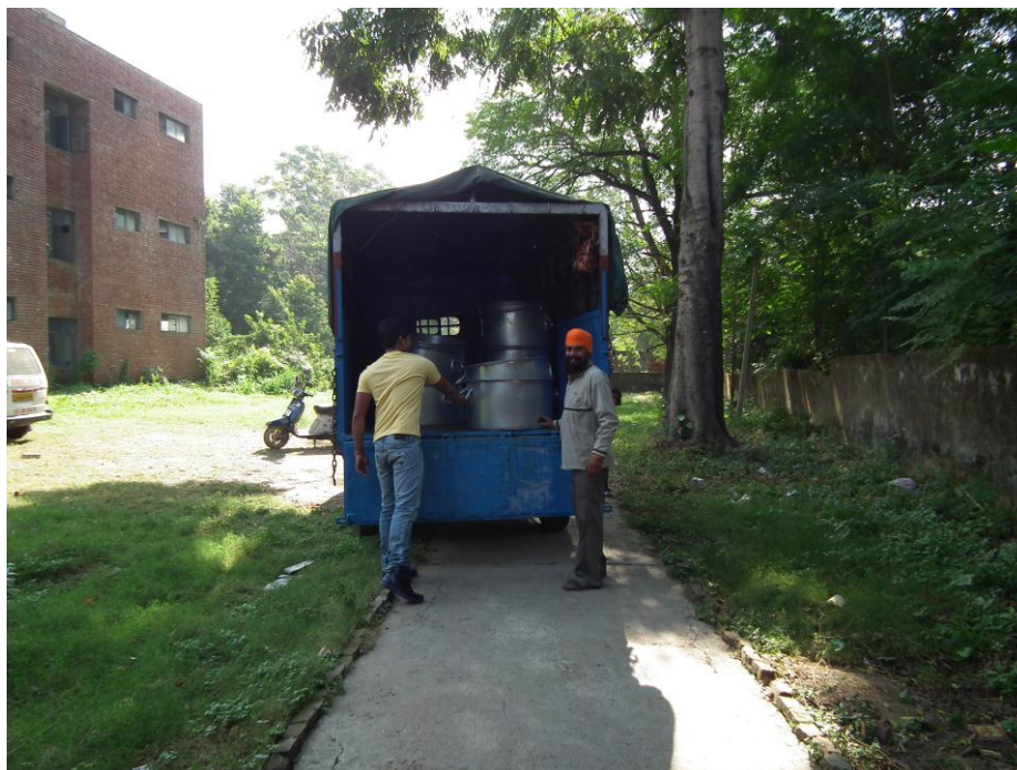
TRANSPORTATION OF FOOD IN SMALL TRUCKS TO SCHOOLS (GPS-SECTOR-12) FROM CENTRALISED KITCHENS

Transportation of food: The cooked meals are transported from the centralized kitchen to schools by trucks. The route is changed daily so that one particular school is not the privileged first school to get the food early.