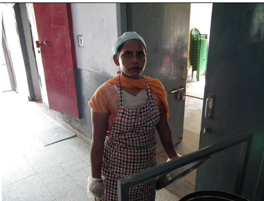
AN AAYA SERVING MDM IN GHS SECTOR-12