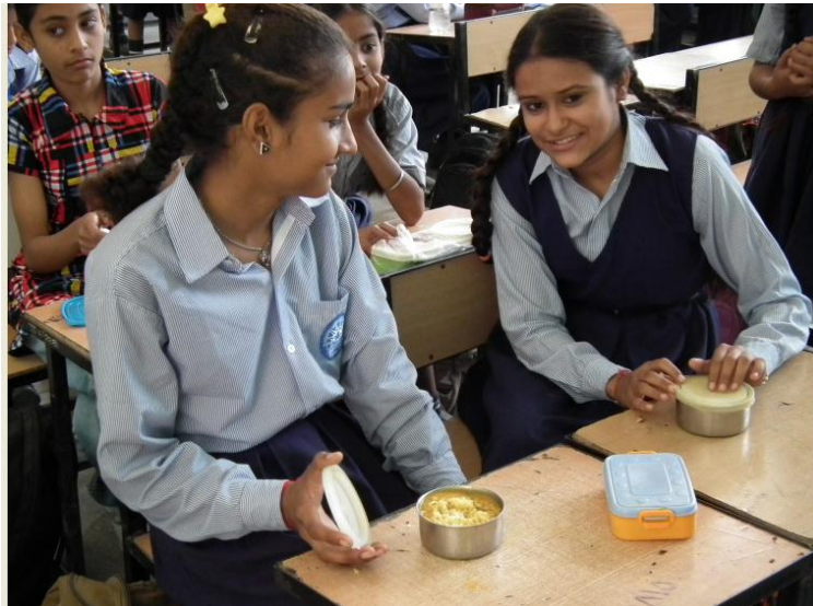
STUDENTS HAVING MDM IN GMSSS- SECTOR-10 (CLASSROOM)