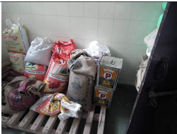
STORAGE ROOM OF KITCHEN SHED OF GMSSS, SECTOR-10