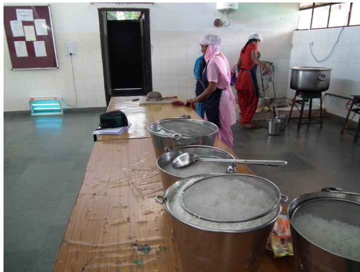
KITCHEN SHED (INSIDE VIEW) OF GMSSS, SECTOR-10

Infrastructure: The four supplying institutes have their own kitchen cum storage areas. Kitchen sheds have been constructed in 7 different Government schools i.e. GMSSS-10, GSSS-15, GMHS-38-D, GMHS-42, GMSSS-44, GMSSS-47, GMSSS-26 with facilities of storage for dry and wet ration etc. and the other three kitchen shed work i.e. GMSSS-23, GMHS-29, GMSSS-40 has been stopped by the administration as to start the seven constructed one and to check the response from these. The one kitchen shed located in GMSSS-10, on trial basis has been started and its running very well.