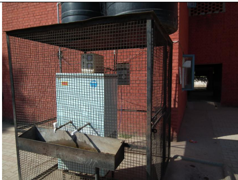
DRINKING WATER FACILITY IN GSSS KHUDDA LAHORA & GHS SEC-12.