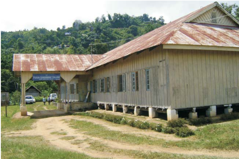
11. Peren Govt. College, Peren