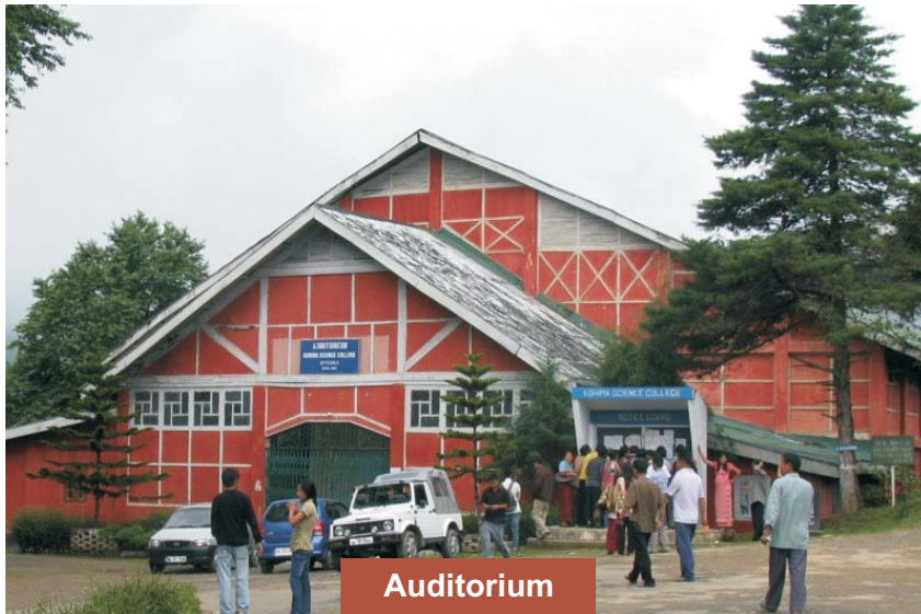
1.Kohima Science College,Jotsoma