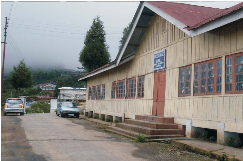
7.Pfutsero College, Pfutsero