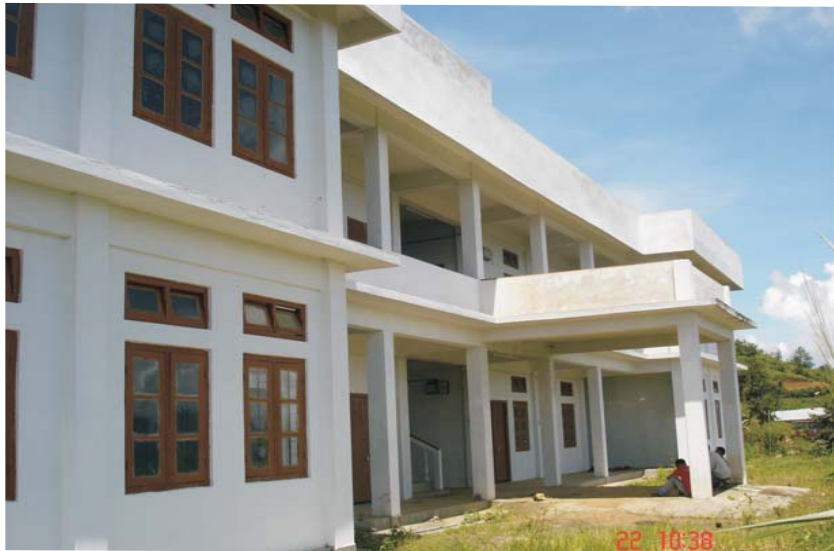
3.Phek Govt. College