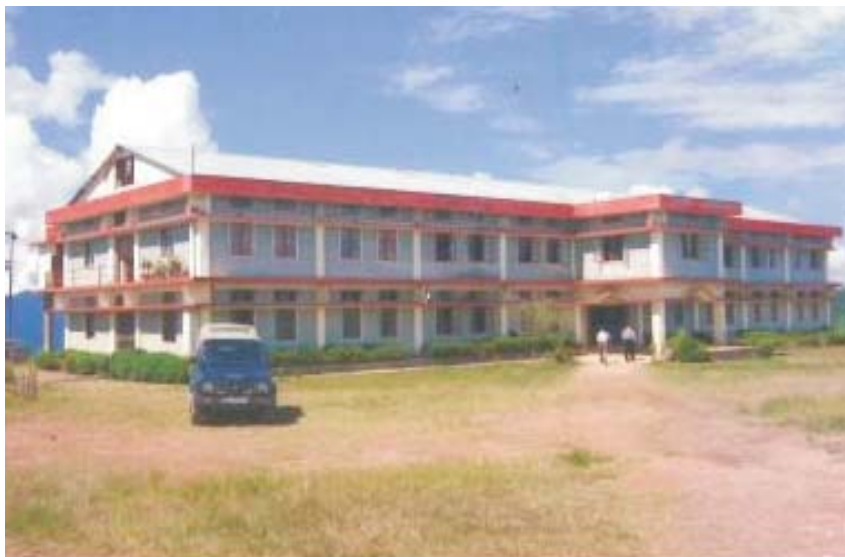
13. Yingli College, Longleng