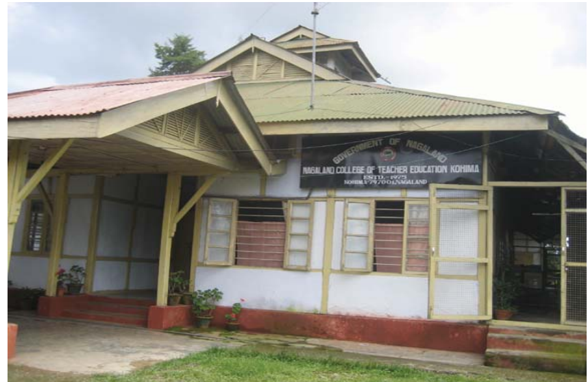
10. Nagaland College of Teacher Education, Kohima