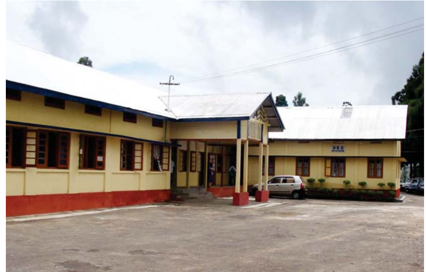
2.Fazl Ali College,Mokokchung