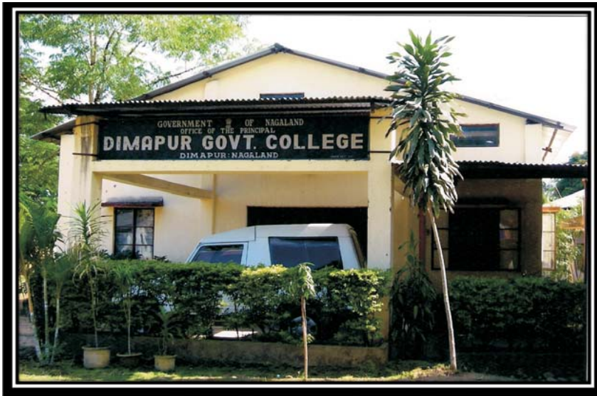
9. Dimapur Govt. College