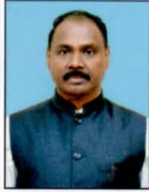
LIEUTENANT GOVERNOR JAMMU & KASHMIR