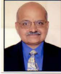
Chief Secretary Jammu & Kashmir