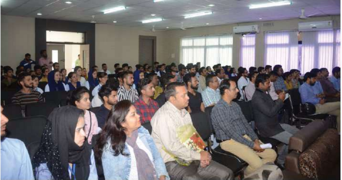
Interactive Workshop for PMSSS Beneficiaries at Geetanjali Institute of Technical Studies, Udaipur on 8 November, 2019