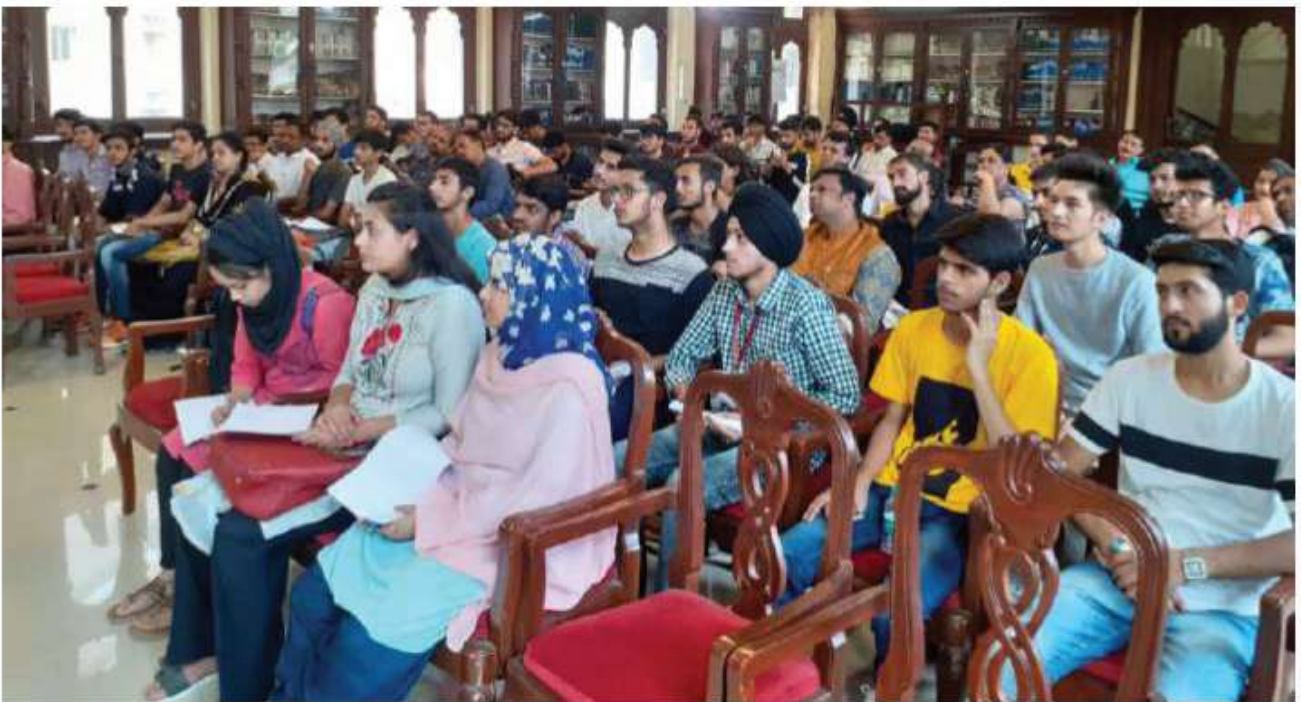
Interactive Session at Anjuman-I-Islam's Karimi Library, I-Complex Mumbai On 16, October 2019