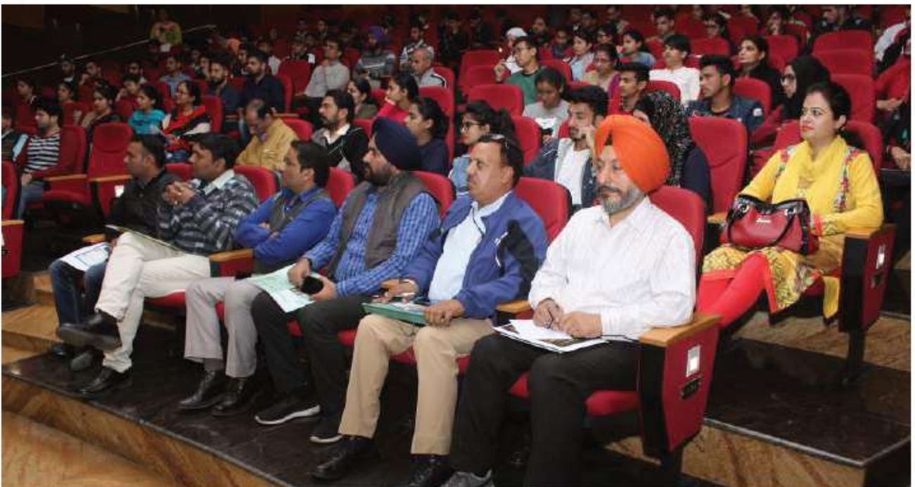
Interactive Workshop for PMSSS Beneficiaries at NITTTR, Chandigarh on 18 November, 2019