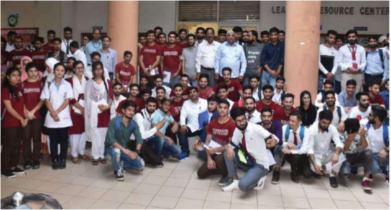
Interactive Session at IES College of Technology, Bhopal On 10, October 2019