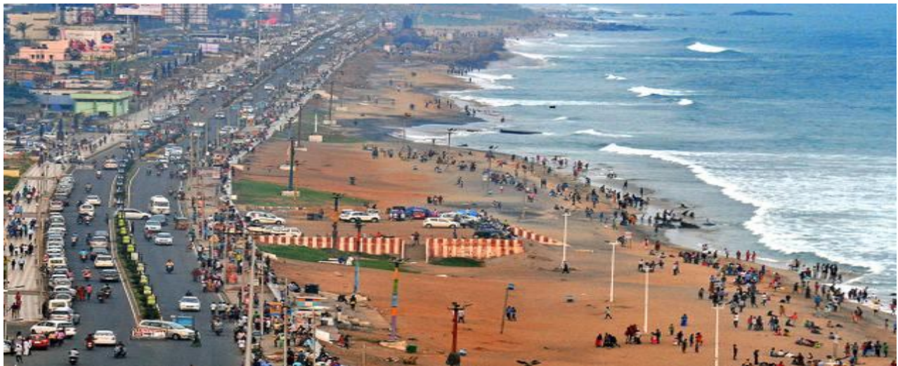
R.K BEACH VIEW (SMART CITY)