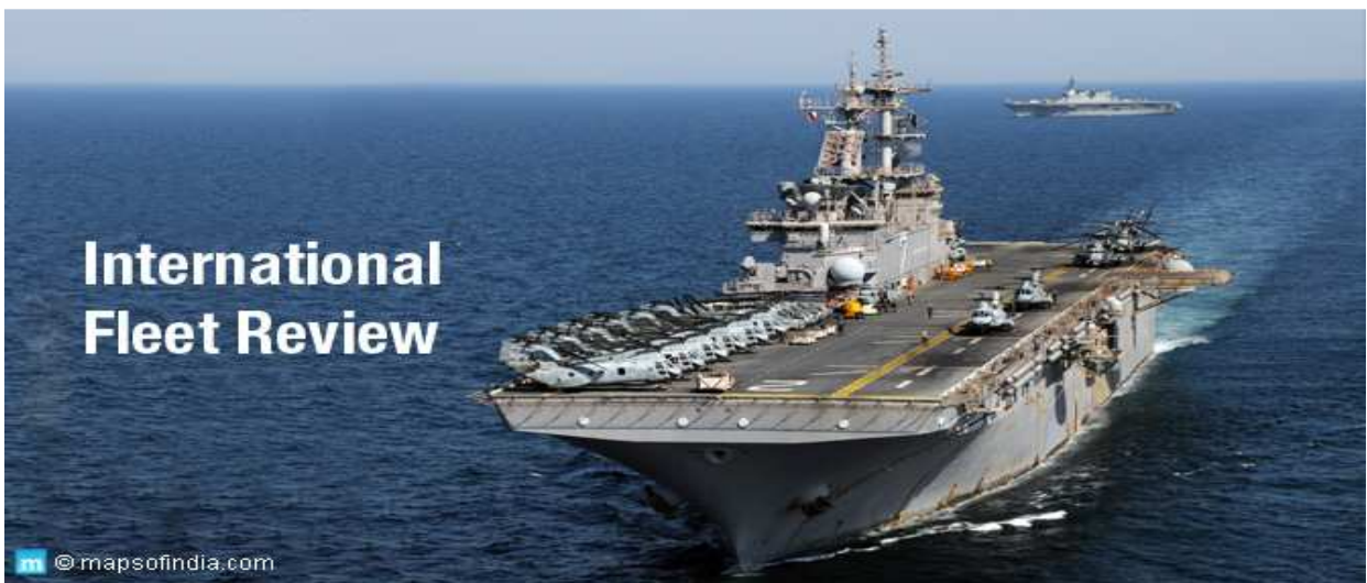
I F R 2016 AT VISAKHA