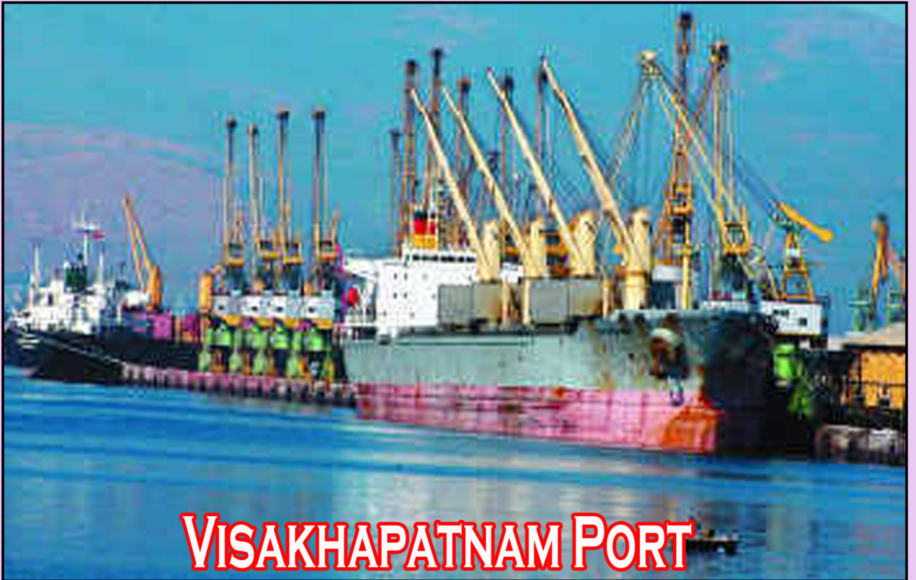
VISA KHAPATNAM PORT