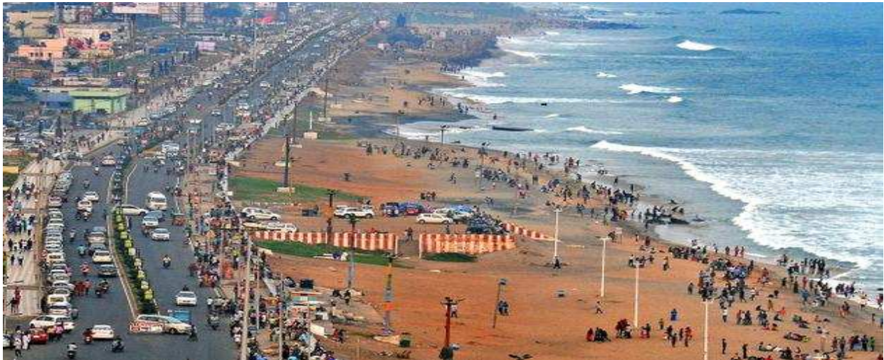
R.K BEACH VIEW (SMART CITY )