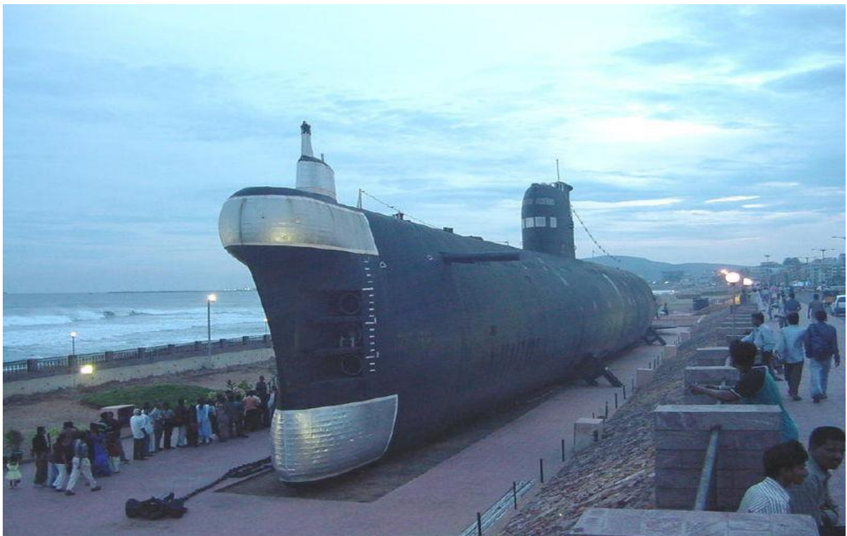
5. Kurasura Submarine