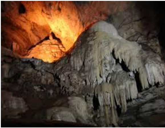
3. Borra Caves