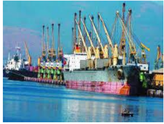
2. Visakhapatnam port