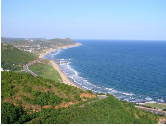
1. Viskhapatnam Beach