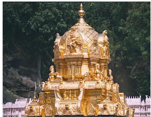
4. Simhachalam Temple