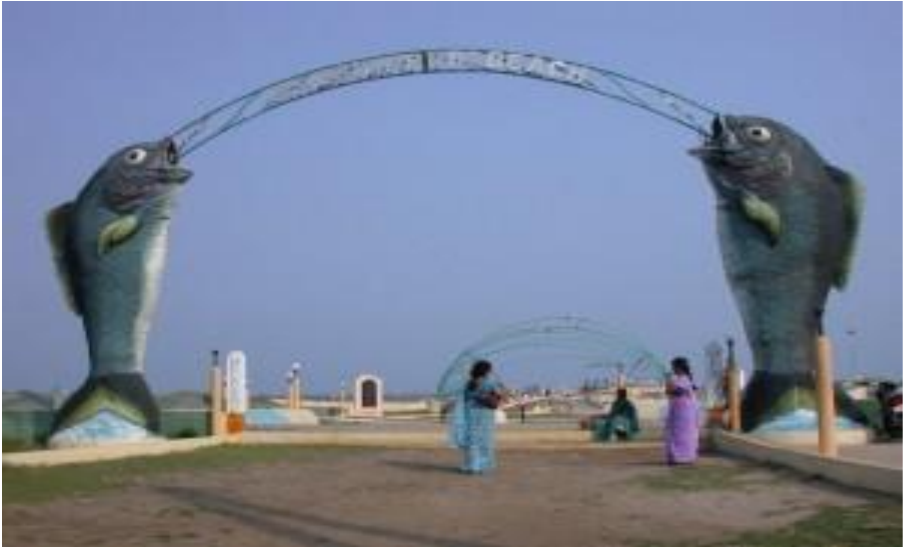
MACHILIPATNAM BEACH ENTRANCE