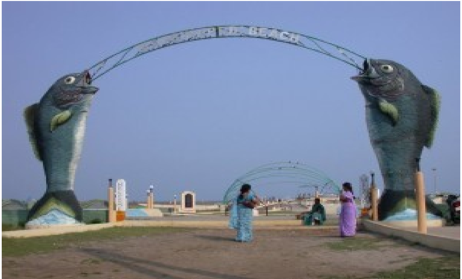
MACHILIPATNAM BEACH ENTRANCE