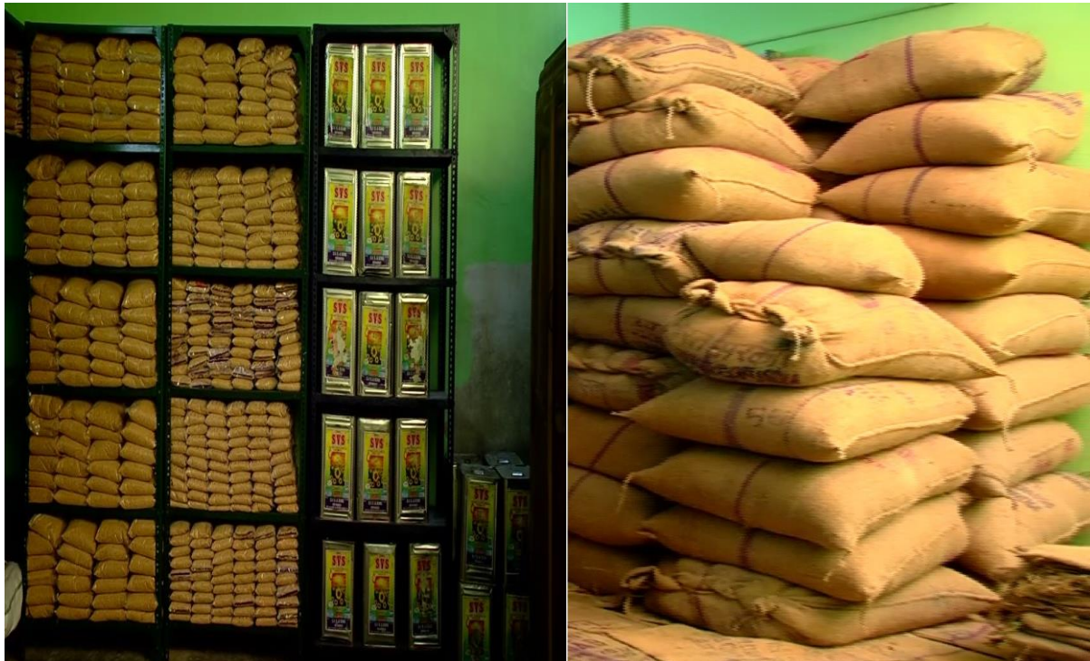
BUFFER STOCK OF DIET ARTICLES IN SCHOOL BASED CLUSTER KITCHEN

The diet and non-diet articles in respect of Puducherry, Karaikal, Mahe and Yanam regions are being supplied by M/s. Puducherry Agro Products Food And Civil Supplies Corporation Limited, Puducherry Central Co-operative Processing Supply and Marketing Society, Karaikal Central Co-operative Processing Supply and Marketing Society and Mahe Employees Co-operative Society and Yanam Co-operative Stores Ltd., respectively on limited tender basis. The supplies are made on monthly basis as per the requirement of the concerned central kitchens / school canteen centres and it is also ensured that adequate quantities of diet articles are kept in the central kitchens. Each central kitchen is equipped with a store room where adequate stock for one month can be stored safely.