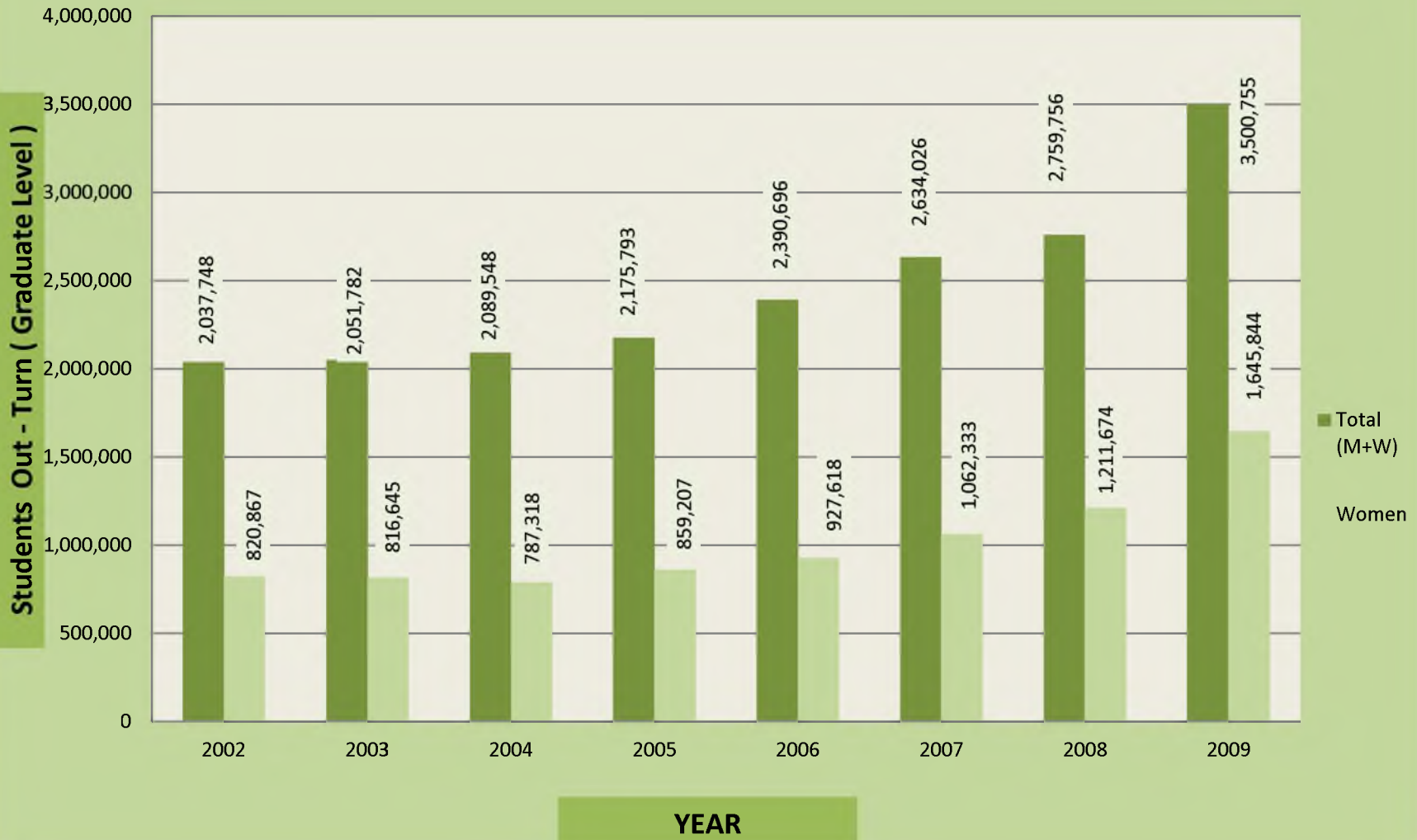
COMPARATIVE GRAPH: OUT-TURN OF GRADUATE - YEAR & GENDER - WISE-2009